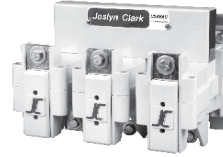
3 Pole, 700A, 600V