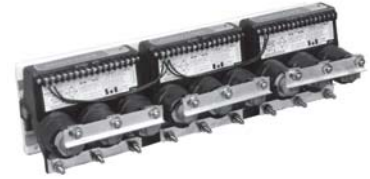
3 Pole, 1000A, 1500V